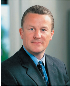
Neil Woodford Invesco Perpetual